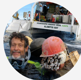
Alga Lita Marine Research and Education.